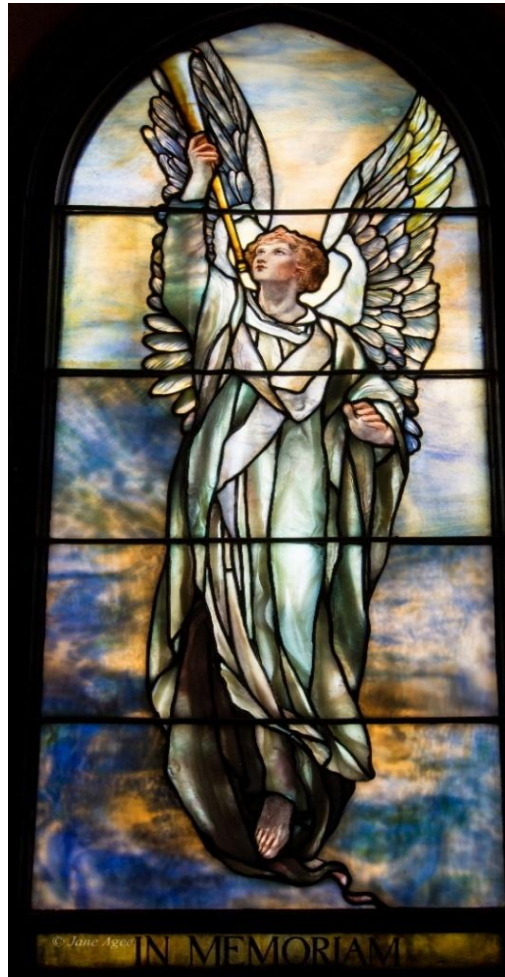
One of three Tiffany windows in Bethesda's west gallery