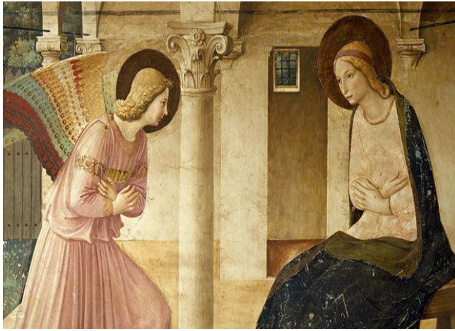
'The Annunciation' by Fra Angelico (15th c.)