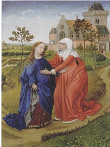
The Visitation of Mary to her cousin, Elizabeth – Rogier van der Weyden, 15 th c.