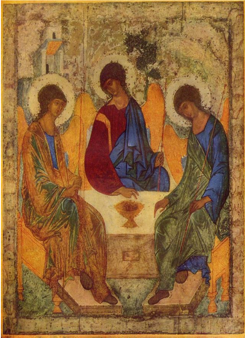
The Hospitality of Abraham is an icon created by Russian painter, Andrei Rublev, in the early 15th century. It depicts the three angels who visited Abraham at the Oak of Mamre (in Genesis, chapter 18) but the painting is also interpreted as an icon of the Holy Trinity.