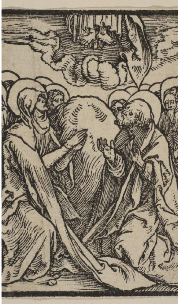
'The Ascension' by Albrecht Dürer (German, Nuremberg 1471–1528)