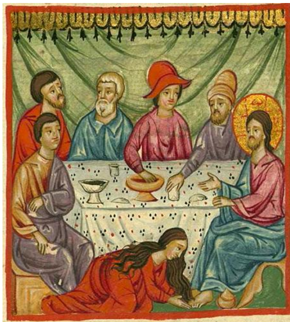
Mary of Bethany Anoints Christ's Feet , 17th c. Illuminated Manuscript from the Walters Art Museum, Baltimore

Chrism Mass The Bishop of Albany will celebrate, preach and bless oils at the annual Chrism Mass at All Saints' Cathedral at 6pm on Monday in Holy Week, 14 April. The Cathedral is located on the corner of South Swan and Elk Streets.