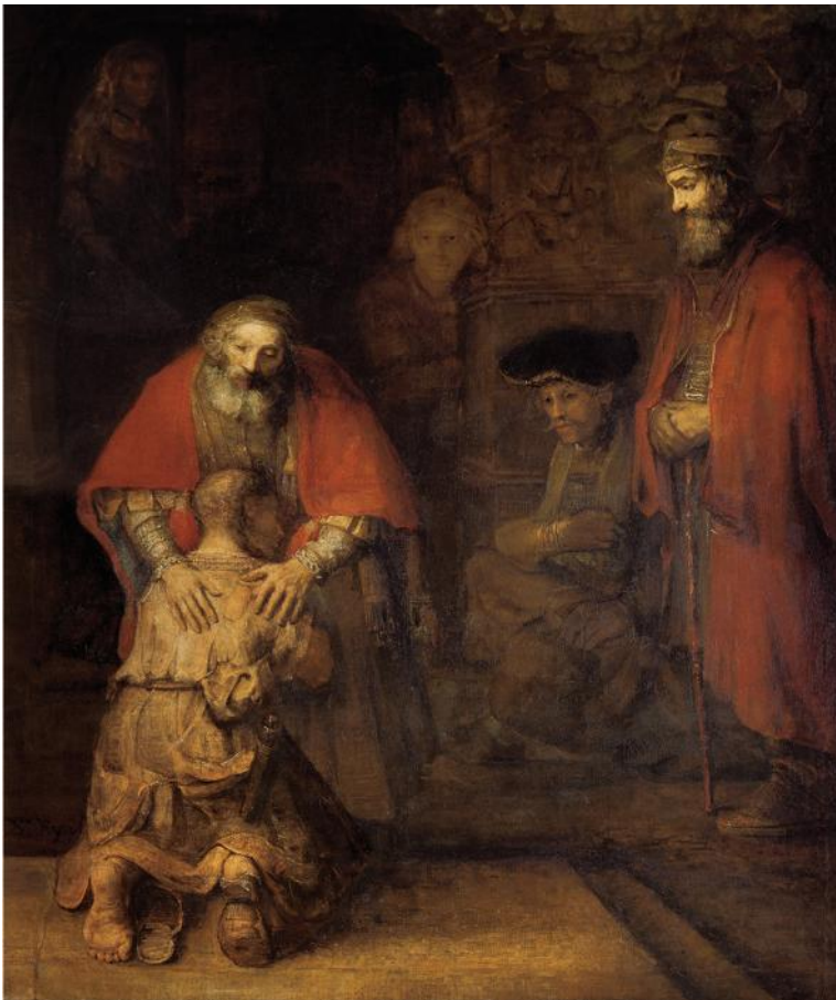
The Prodigal Son, Rembrandt (1606-1669)