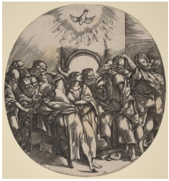
The Descent of the Holy Spirit (Engraving, 1518) by Domenico Campagnola from the Rosenwald Collection at the National Gallery of Art

Please leave donated items in the box by the side door entrance of the church. Thank you!