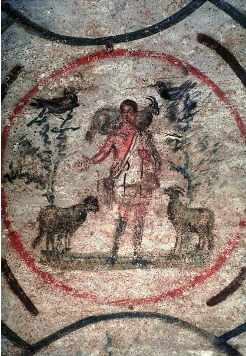
Center of the ceiling of the "Velatio" cubicle: the Good Shepherd (also sheep and doves with olive branches in trees). Location: Catacomb of Priscilla, Italy, Rome. Date: Second half of the 3rd century, artist unknown.