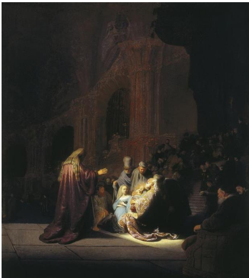
Rembrandt van Rijn (1606–1669) Simeon's Song of Praise , 1631

As chronicled in the Gospel of Luke, the elderly Simeon was promised that he would not die before seeing the Messiah. Rembrandt depicts a divinely illuminated Simeon acknowledging the child in his arms. Mary and Joseph sink in astonishment while the prophetess, Anna, appears before the group to offer a blessing.