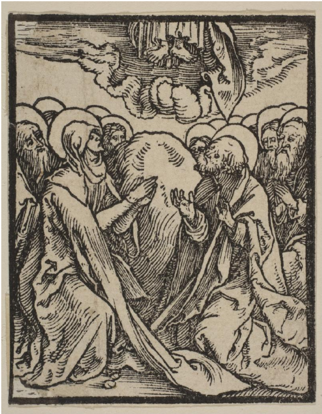
'The Ascension' by Albrecht Dürer (German, Nuremberg 1471–1528)