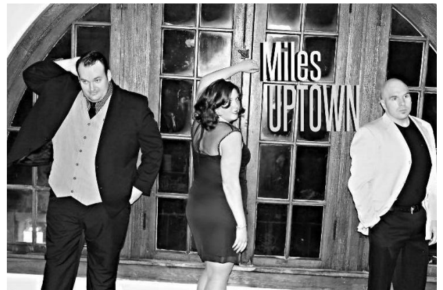
They're good: I've seen them –Ed.

Performing songs of yesterday and today with a jazzy twist. Come out and see them perform Friday, February 19 th from 7-10 at the Crown Grille at Circus Café!